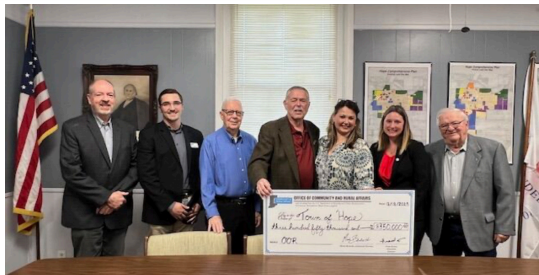
TOWN OF HOPE AWARDED $350,000 FOR OOR

SIRPC BROADBAND CLEARINGHOUSE: https://broadband.sirpc.org/